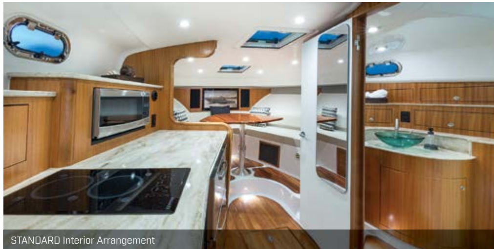
STANDARD Interior Arrangement

Contact your factory authorized dealer today and experience the excitement of Pursuit.