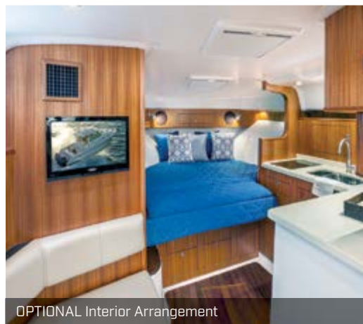
OPTIONAL Interior Arrangement